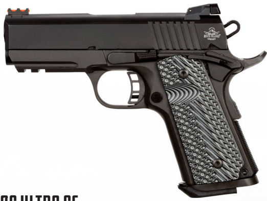
TAC ULTRA CS