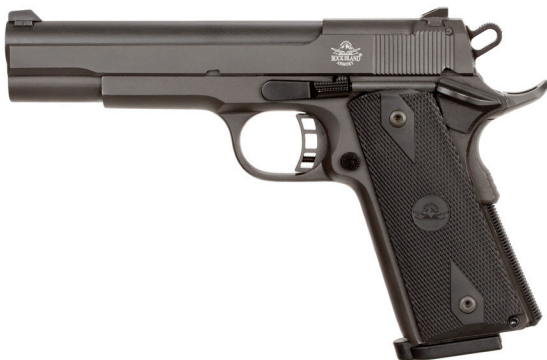
XT 22 STANDARD COMBO

Imagine a true 1911 that fires a fast and deadly .22 Magnum round. For a one-of-a-kind shooting experience with a round powerful enough for small rifles, the XT Series delivers. Try it to believe it.