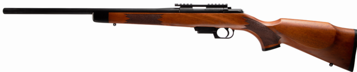
M22 TCM BA

If you're looking for a rifle with match-class accuracy, dominant small game abilities or just plinking fun, we've got you covered with either semi-automatic or bolt-action models. Don't forget our classic TCM rifles with a magazine compatible with our popular TCM pistols.