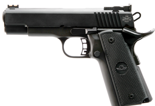
TCM STANDARD M5