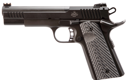
XT 22 MAGNUM TARGET

ITEM CODE CALIBER CAPACITY BARREL LENGTH 56789 22MAG 14 5"