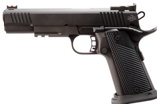
TCM PREMIUM FS