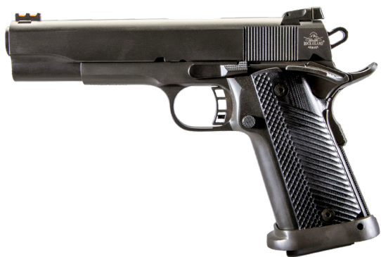
ROCK ULTRA HC