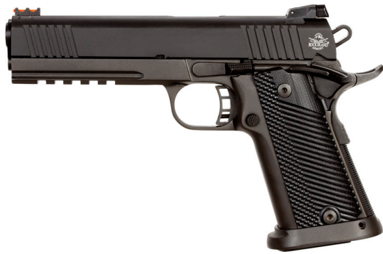
TAC ULTRA FS HC