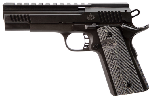
XT 22 MAGNUM PRO

ITEM CODE CALIBER CAPACITY BARREL LENGTH 56789 22MAG 14 5"