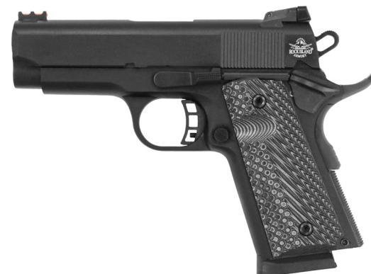
ROCK ULTRA CS-L