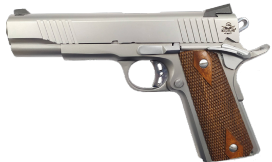
EFS STAINLESS STEEL 1911 F5

ITEM CODE CALIBER CAPACITY BARREL LENGTH 51857 45ACP 7 4.2"