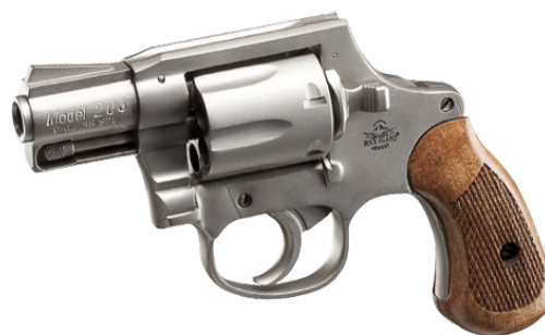
M206 SPURLESS MATTE NICKEL