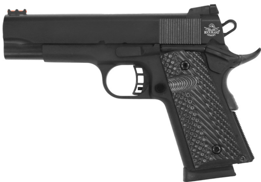
ROCK ULTRA CCO

ITEM CODE CALIBER CAPACITY BARREL LENGTH 51857 45ACP 7 4.2"