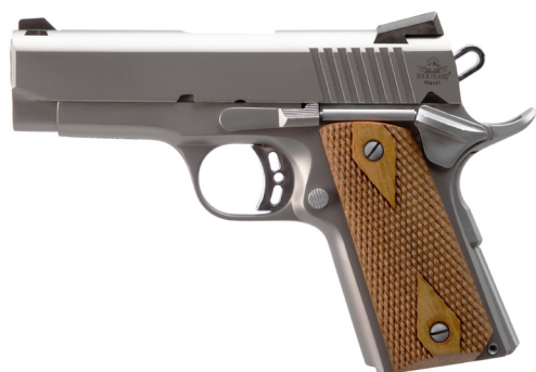
ROCK STAINLESS STANDARD CS