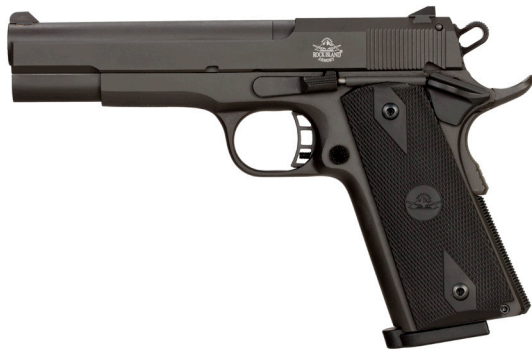
XT 22 MAGNUM