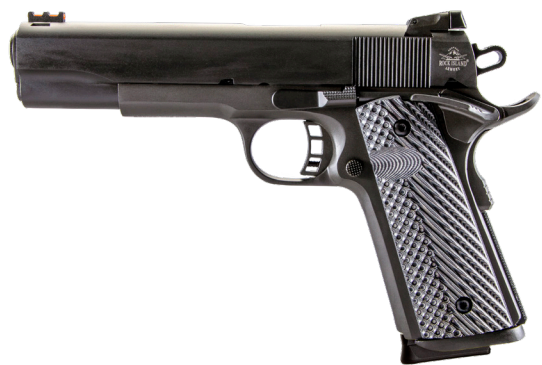
ROCK ULTRA F5