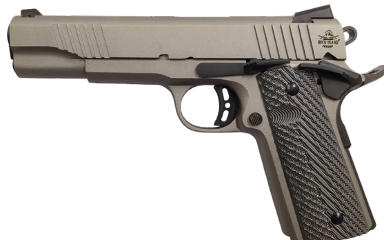
ROCK STANDARD F5 CERAKOTE